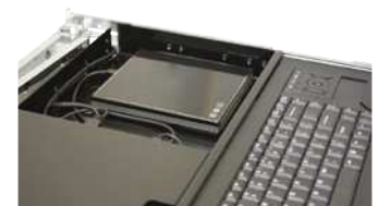
External Optical and Hard Drive storage space