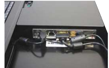
Convenient access to computer I/O Panel