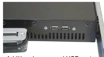
Additional rear panel USB ports