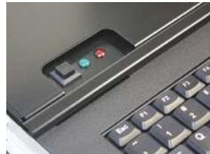
Computer Power Switch and activity indicators